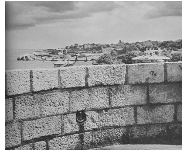
Telemachus: Martello Tower 3