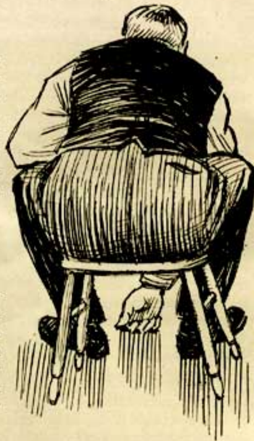
Showing how body should be bent forward so as to tighten painful muscles for treatment of lumbago.

In this electrode the virtues of the Violet Ray are combined with the virtues of ozone and the pine-laden air of the North woods. Those who cannot go to the pine woods for relief of Hay Fever, Lung and